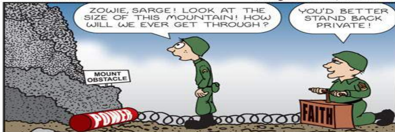
For verily I say unto you, That whosoever shall say unto this mountain, Be thou removed, and be thou cast into the sea; and shall not doubt in his heart, but shall believe that those things which he saith shall come to pass; he shall have whatsoever he saith. - MARK 11:23 KJV