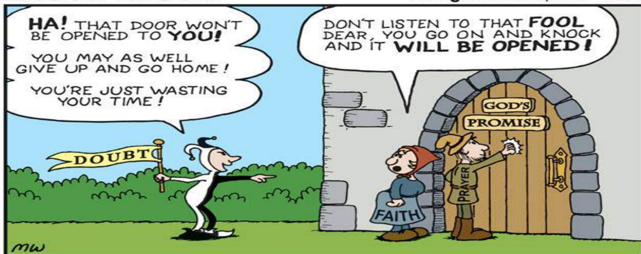
Ask, and it shall be given you; seek, and ye shall find; knock, and it shall be opened unto you: