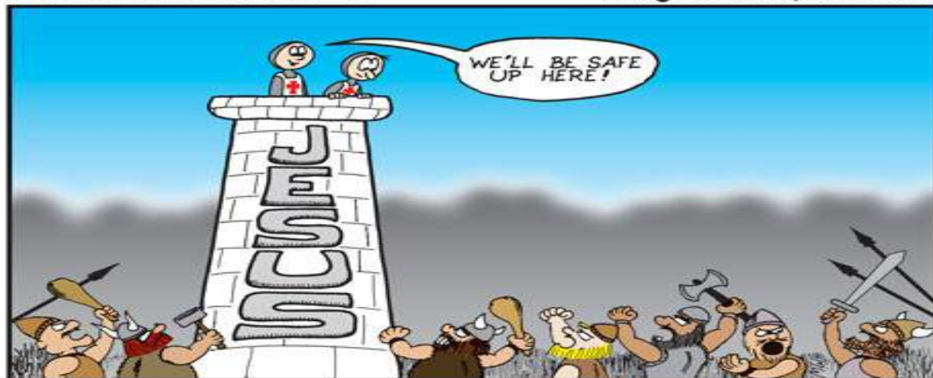
The name of the LORD is a strong tower: the righteous runneth into it, and is safe. -PROVERBS 18:10 KJV