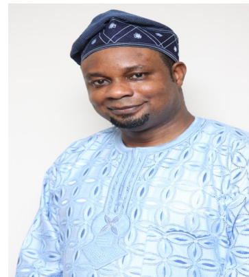
PRINCE ADEWALE ADEOLA